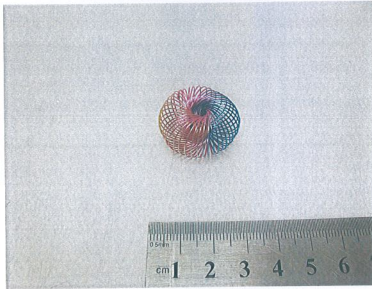
Photo of the sample