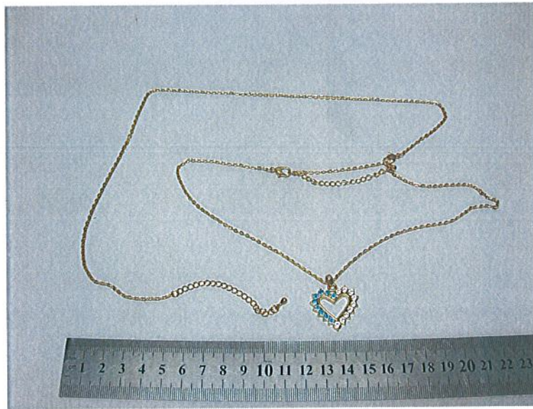
Photo of the sample