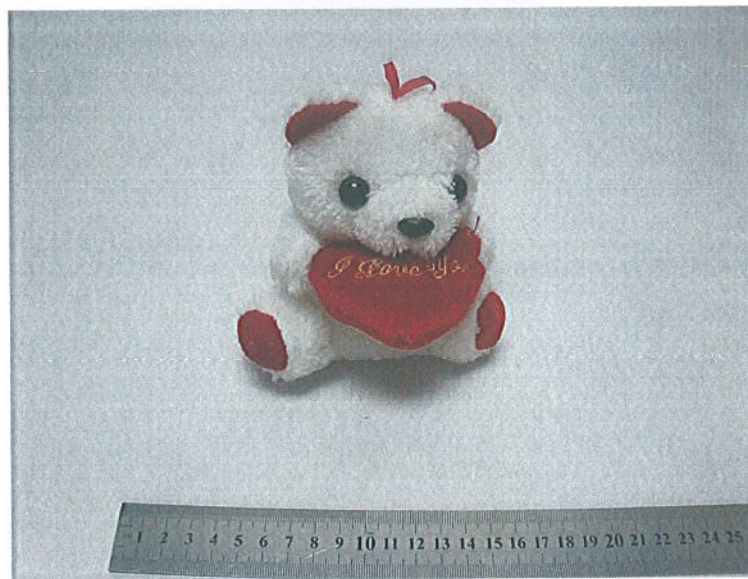
Photo of the sample