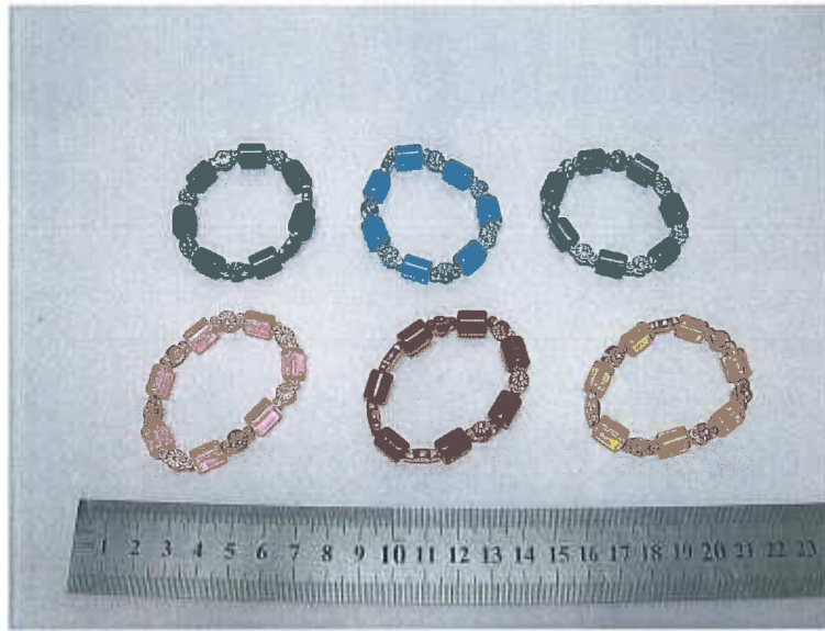
Photo of the sample