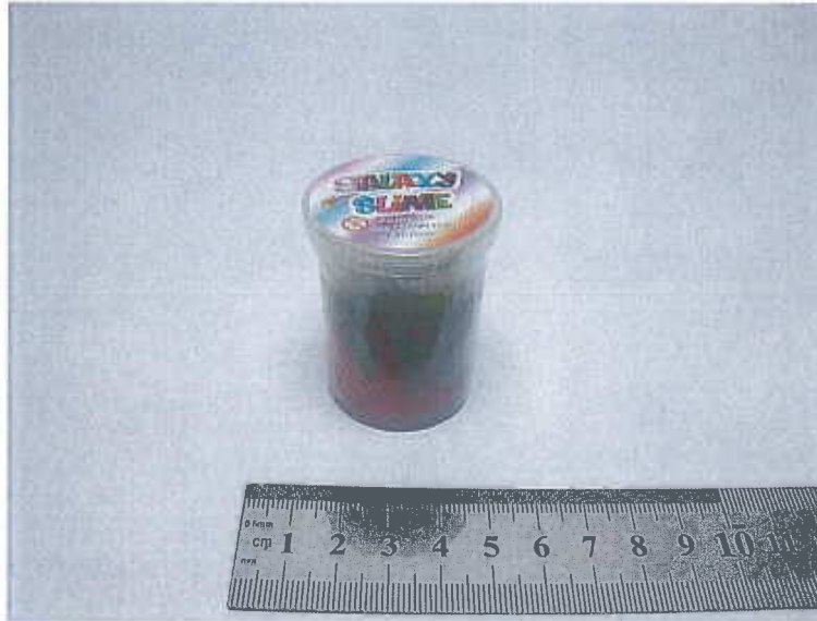
Photo of the sample